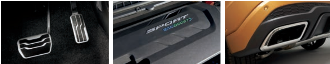
Electric Spice. Available equipment.