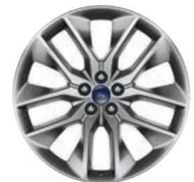
20" Polished Aluminum with Dark Stainless-Painted Pockets Available