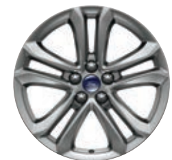
18" Polished Aluminum Available: SEL