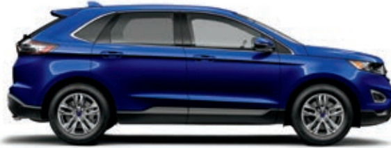
Deep Impact Blue