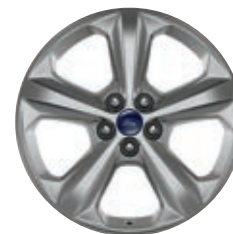
18" Sparkle Silver-Painted Aluminum Standard: SE

3.5L Ti-VCT V6 engine 18" polished aluminum wheels (requires 201A) 2nd-row outboard inflatable safety belts All-wheel drive (AWD) Black roof-rack side rails (n/a with Vista Roof®) Cargo Accessories Package includes cargo area cover, cargo area protector and rear bumper protector Class II Trailer Tow Package includes trailer sway control Dual Headrest DVD by INVISION 2 (late availability) Front and rear all-weather floor mats P235/60R18 all-season snow chain-compatible tires Panoramic Vista Roof (requires 201A) Technology Package includes voice-activated Navigation System with integrated SiriusXM® Traffic and Travel Link® services with 5-year trial subscription, BLIS® (Blind Spot Information System) with cross-traffic alert, Remote Start System, auto-dimming driver's sideview mirror, and 110-volt power outlet (requires 201A) Utility Package includes foot-activated hands-free power liftgate; perimeter alarm; and universal garage door opener (requires 201A)