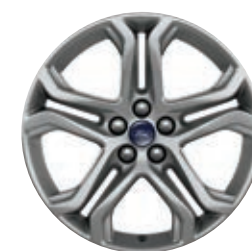
19" Luster Nickel-Painted Aluminum Standard