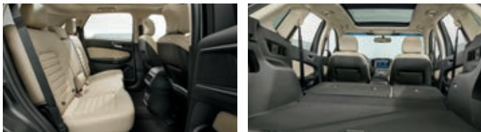
SEL. Guard. Available equipment.