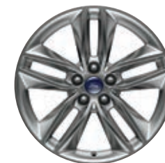
18" Sparkle Silver-Painted Split-Spoke Aluminum Standard: SEL