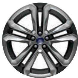
20" Polished Aluminum with Low-Gloss Magnetic-Painted Pockets Standard